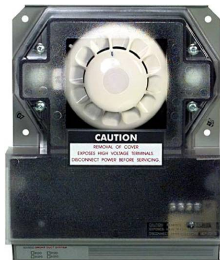
Duct Sensor Housing, Front View, Shown with 4098-5202 Sensor