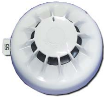
4098-5202 Photoelectric Sensor