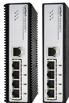
12V model 48V model